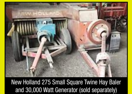
New Holland 275 Small Square Twine Hay Baler and 30,000 Watt Generator (sold separately)