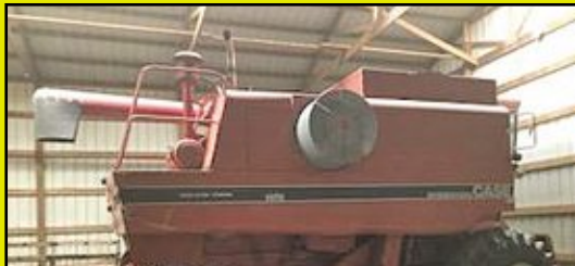
1470 International Combine: 4,725 Hours, Serial #X020104X, Model #1470LL296*3 Heads (sold separately)

AUCTIONEER'S COMMENT: The Korte family has been farming this farm for 62 years and have decided to have a retirement auction. There will be 2-3 hours of household personal property items and numerous tools sold first, followed by the many farm equipment items. Most of this machinery has always been used up to date of sale by the Kortes. A good share was always shedded.