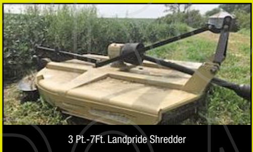
3 Pt.-7Ft. Landpride Shredder