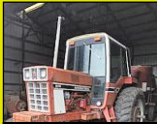
(986) International Wide Front End Tractor, 8930 Hours, 100 HP, Model #F986 Serial #2510192U21055