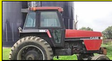
(2294) Case International Wide Front End Tractor, 7596 Hours, 140 HP, Duals 18.4X38, Model #2294, Serial #16243781