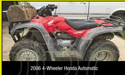
2006 4-Wheeler Honda Automatic