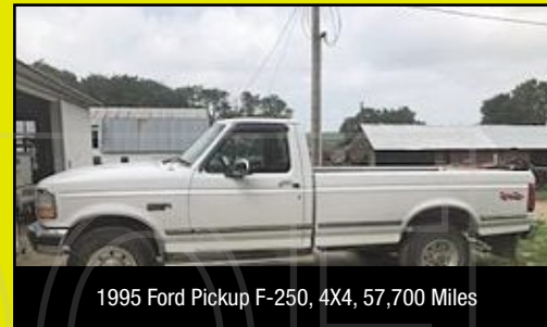
1995 Ford Pickup F-250, 4X4, 57,700 Miles