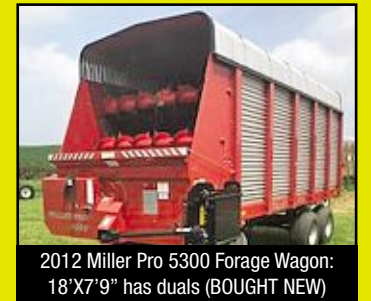
2012 Miller Pro 5300 Forage Wagon: 18'X7'9" has duals (BOUGHT NEW)