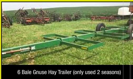
6 Bale Gnuse Hay Trailer (only used 2 seasons)