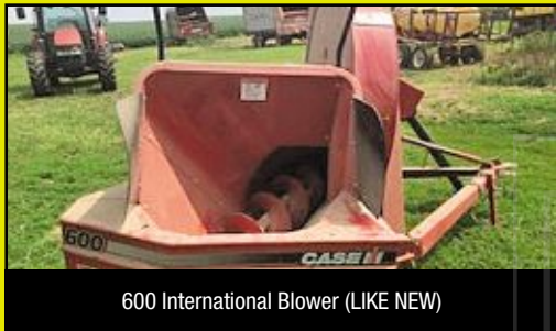
600 International Blower (LIKE NEW)