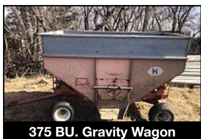
375 BU. Gravity Wagon