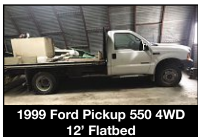
1999 Ford Pickup 550 4WD 12' Flatbed