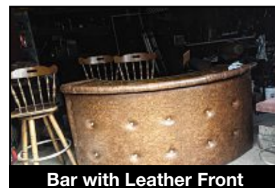
Bar with Leather Front