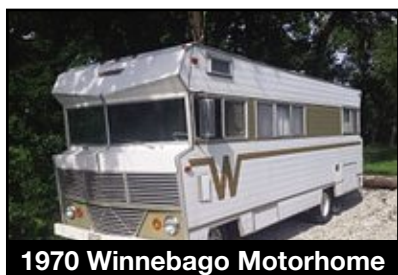
1970 Winnebago Motorhome