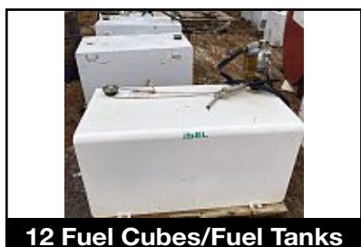
12 Fuel Cubes/Fuel Tanks

For more information contact: BUSS REALTY & AUCTION, LLC 1470-25th Avenue Columbus, NE**Phone: 402-564-7915