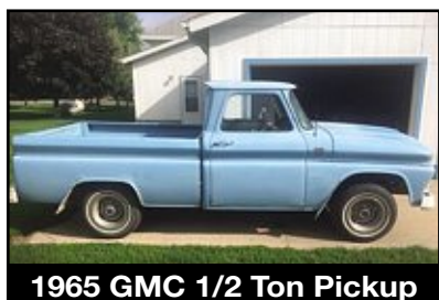
1965 GMC 1/2 Ton Pickup