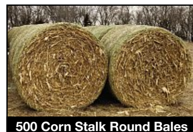
500 Corn Stalk Round Bales

Visit www.bussauction.com for commission charges for each individual item, MORE photos and sale bill.