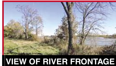
VIEW OF RIVER FRONTAGE

LEGAL DESCRIPTION: Approximately 7.5 acres (+/-) in the southeast corner of the East Half of the Southwest Quarter of Section Thirty-Five (35), Township Seventeen (17), North, Range One (1) West of the 6th P.M.; and Lots One (1) and Two (2) and the East Forty-One (41) links of Lots Three (3) and Four (4) in Section Two (2), Township Sixteen (16) North, Range One (1) West of the 6th P.M., and all accretions thereto, all in Platte County, Nebraska.