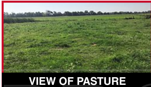
VIEW OF PASTURE