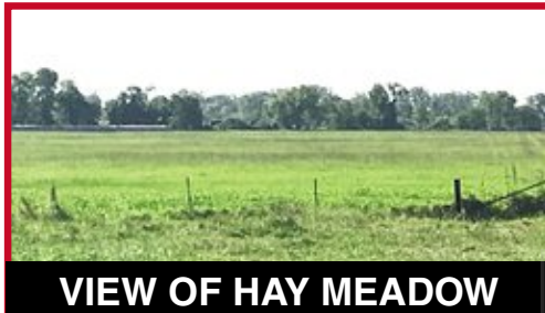
VIEW OF HAY MEADOW

COMMENT: This is an opportunity to purchase a combination of income producing pasture with hay meadow and ¼ mile of Platte River Frontage with recreational value. Only minutes South of Columbus, NE.