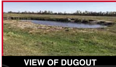
VIEW OF DUGOUT